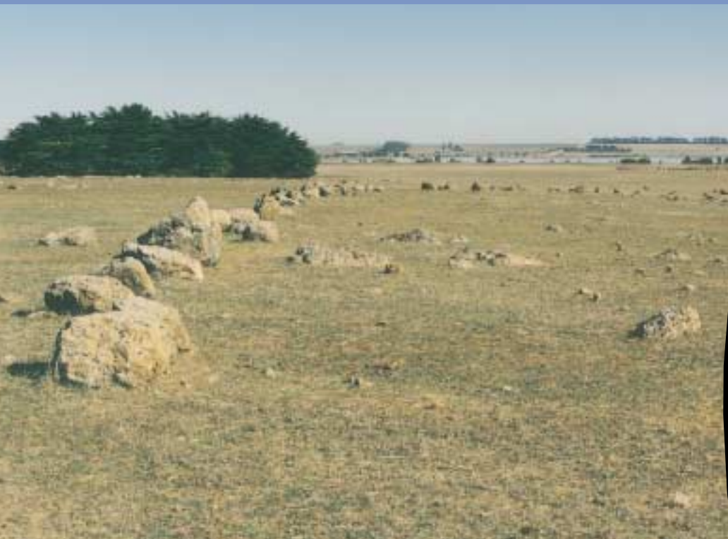
LAKE BOLAC STONE ARRANGEMENT