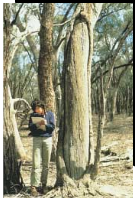
HERITAGE OFFICER RECORDING A SCARRED TREE