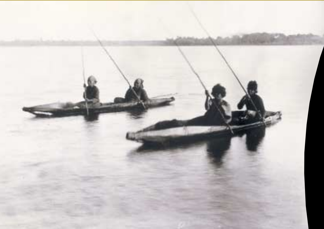
ABORIGINAL PEOPLE IN CANOES ON LAKE TYERS 1886